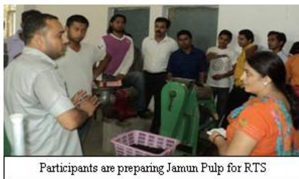
Participants are preparing Jamun Pulp for RTS

Entrepreneurship Development Programme exclusively in the trade of Food Processing was organized by NITCON, Chandigarh in technical collaboration with CIPHET, Abohar for about 30days. Around 30 young entrepreneurs participated in the programme.