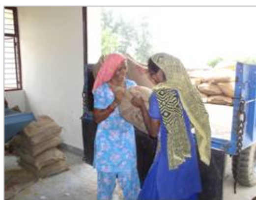
Women workers engaged in various unit operations of cleaning and grading of grains