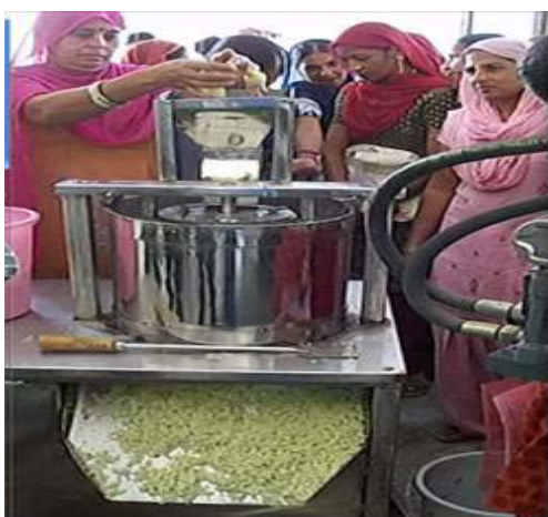
Hands on training of participants on Aonla processing plant at CIPHET, Abohar