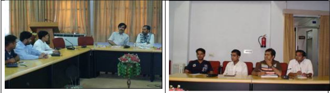
Training of NAIP research associates