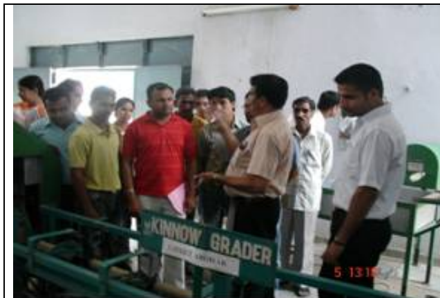
Trainees at Kinnow Processing Pilot Plant