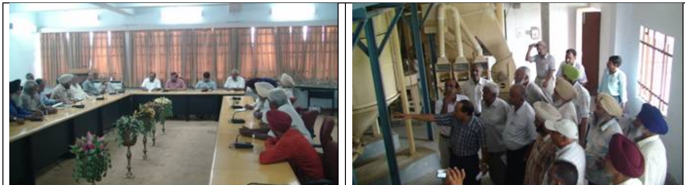
Progressive farmers from Hoshiarpur district visiting CIPHET and Dal mill complex

Farmers showed special interest in utilizing Pilot Plant facilities of the Institute under Custom Hiring Programme.