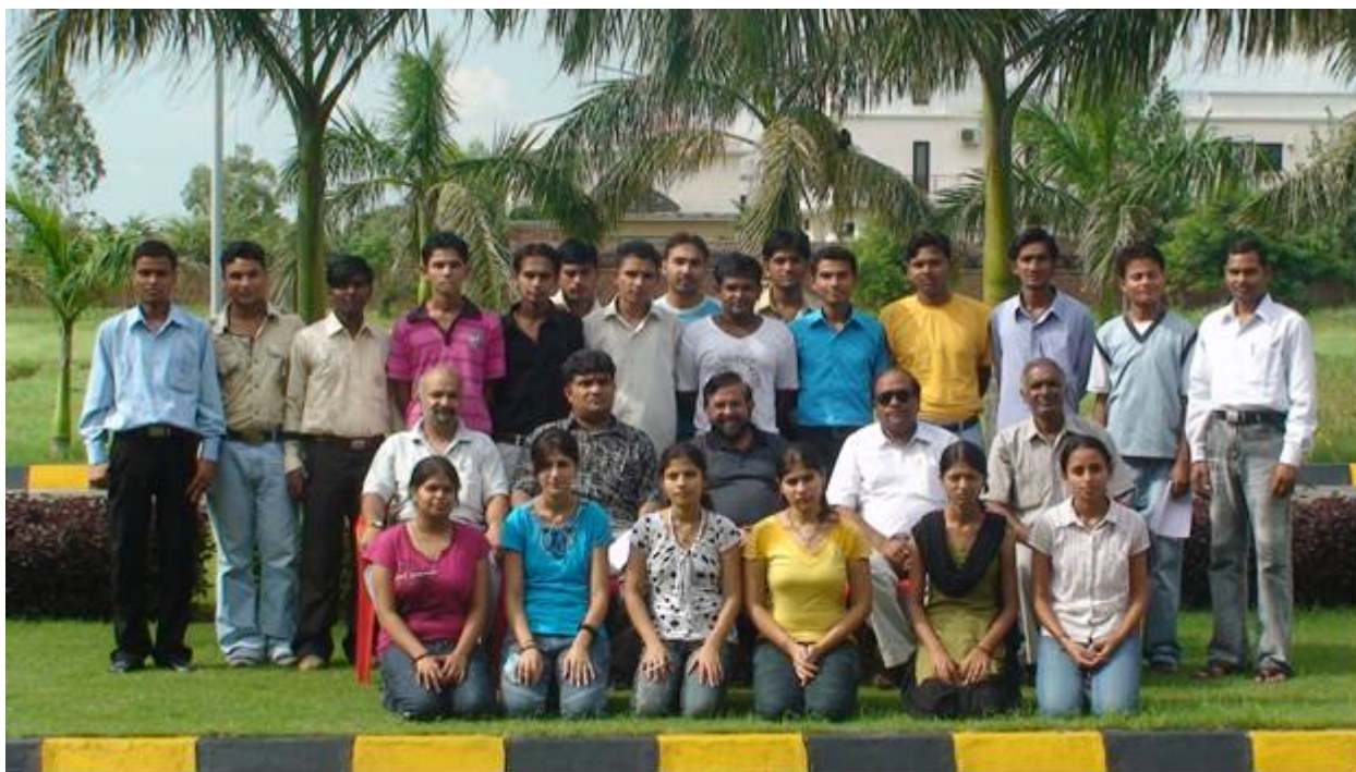
B Tech Engineering Trainees at CIPHET Ludhiana