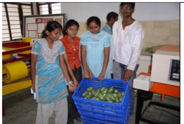
B Tech trainees working on shrink wrapping of mangos