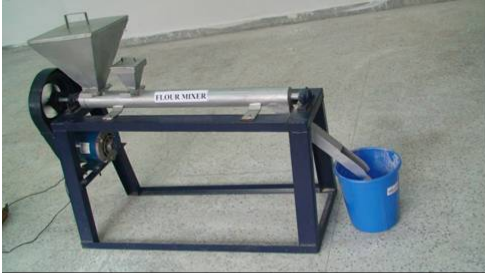
Low cost flour mixer developed at CIPHET for production of composite flours and micro nutrient enriched flours

minerals or defatted soy flour or any powdered material that is to be mixed in the main batch of flour. The mixing capacity of developed Flour Mixer is about 200 kg/h. The unique design of the flights of the conveying-cum-mixing screw the mixing efficiency was found to be 99.9 % (ratio of flour color index as per Oliver et al., 1992 (ratio of L-b of mixture flour to L-b of ideal mix)