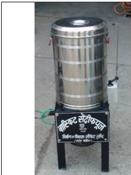
CIPHET basket centrifuge for minimal processing of vegetables for Barapani

As part of the prototype multiplication and testing activity two units of basket centrifuge were fabricated in CIPHET workshop for Division of Horticulture, ICAR research complex for NEH region, Umiam, Meghalaya. This is an effort in the direction to motivate agricultural machinery manufacturers to fabricate low cost processing machines for decentralized processing in production catchments. The cost of the unit is Rs. 15000.00 excluding packaging and forwarding charges.