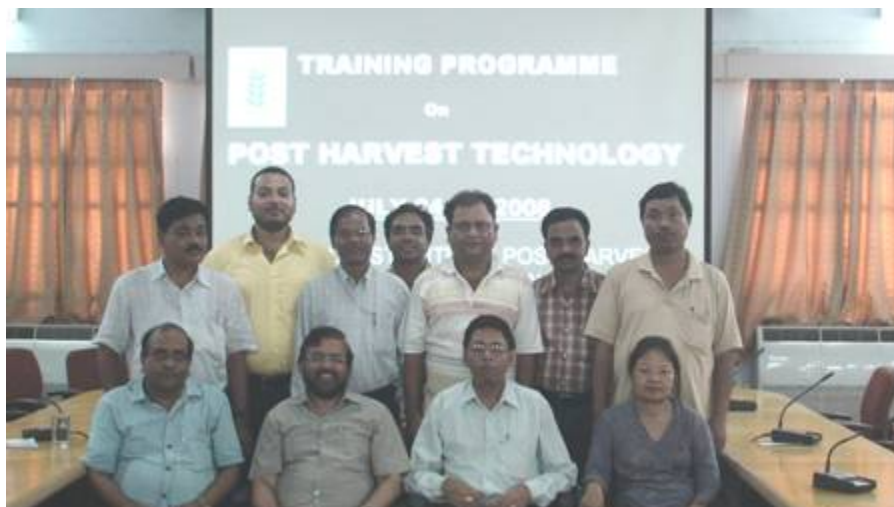
Participants from North East for training under NAIP on 'Livelihood Improvement and Empowerment of Rural Poor through sustainable farming systems in the North East India'