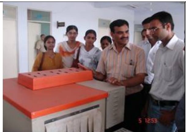
Demonstration of Shrink Wrapping of fruits