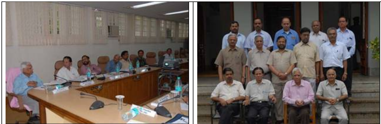
PSC meeting of Engineering SMD at IINRG, Ranchi

outcome. He also suggested that there is need to bring out a consolidated report by each PC on the significant achievements made under adhoc projects and suggest follow up actions.