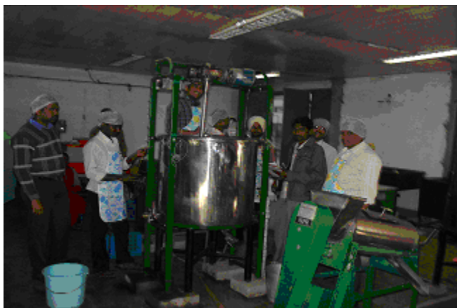
Trainees preparing tomato puree at food factory in CIPHET (500 kg/day)

tomato puree and powder making plant, followed by practical training on making puree & powder by the trainees. The lectures in simple language on quality control, standard methodology, packaging methods, economics and project preparation were given by the scientists of CIPHET who have developed this pilot plant. The trainees were awarded certificate for this cottage technology based on which they can apply for necessary finance for setting up rural industry.