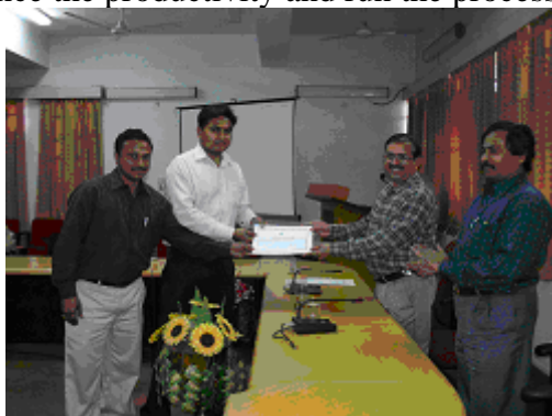
Proprietor of Golden corn receiving the membership certificate

There is an urgent need for maize-based industry in the state in view of a rising surplus, but upcoming entrepreneurs do not get proper guidance and help to set-up new venture. CIPHET Ludhiana helps in such endeavours. M/s. Golden Corns (India) Private Ltd, Kangra, HP has registered with Central Institute of Post-Harvest Engineering & Technology (CIPHET), Ludhiana for establishing maize processing unit. CIPHET will help the firm for scientific storage and setting up of plant in form of advisory consultancy to enhance the productivity and run the processing plant smoothly.